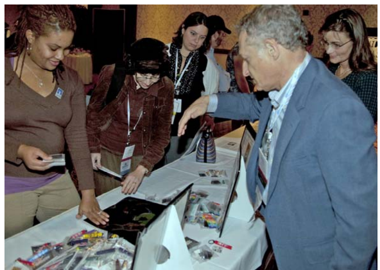
E day 2010