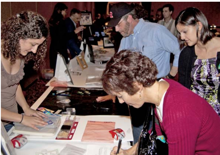
FiO 2010 Student Contest: Feeding Young Minds